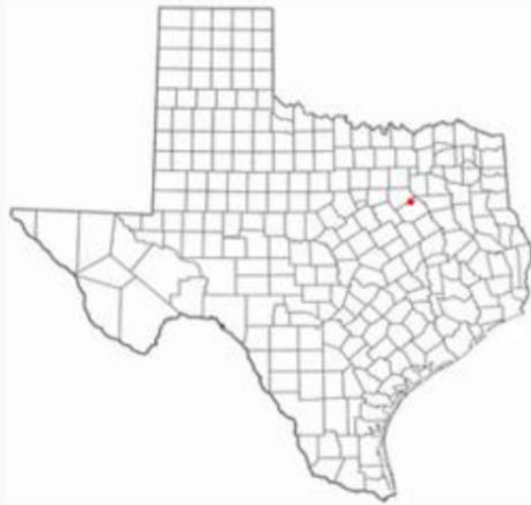
Location of Rice, Texas